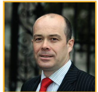
Denis Naughten TD

The IRHA have made it clear to the Minister that Members of the IRHA cannot countenance paying any additional charge which is unjustified and threatens to further undermine their competitiveness.